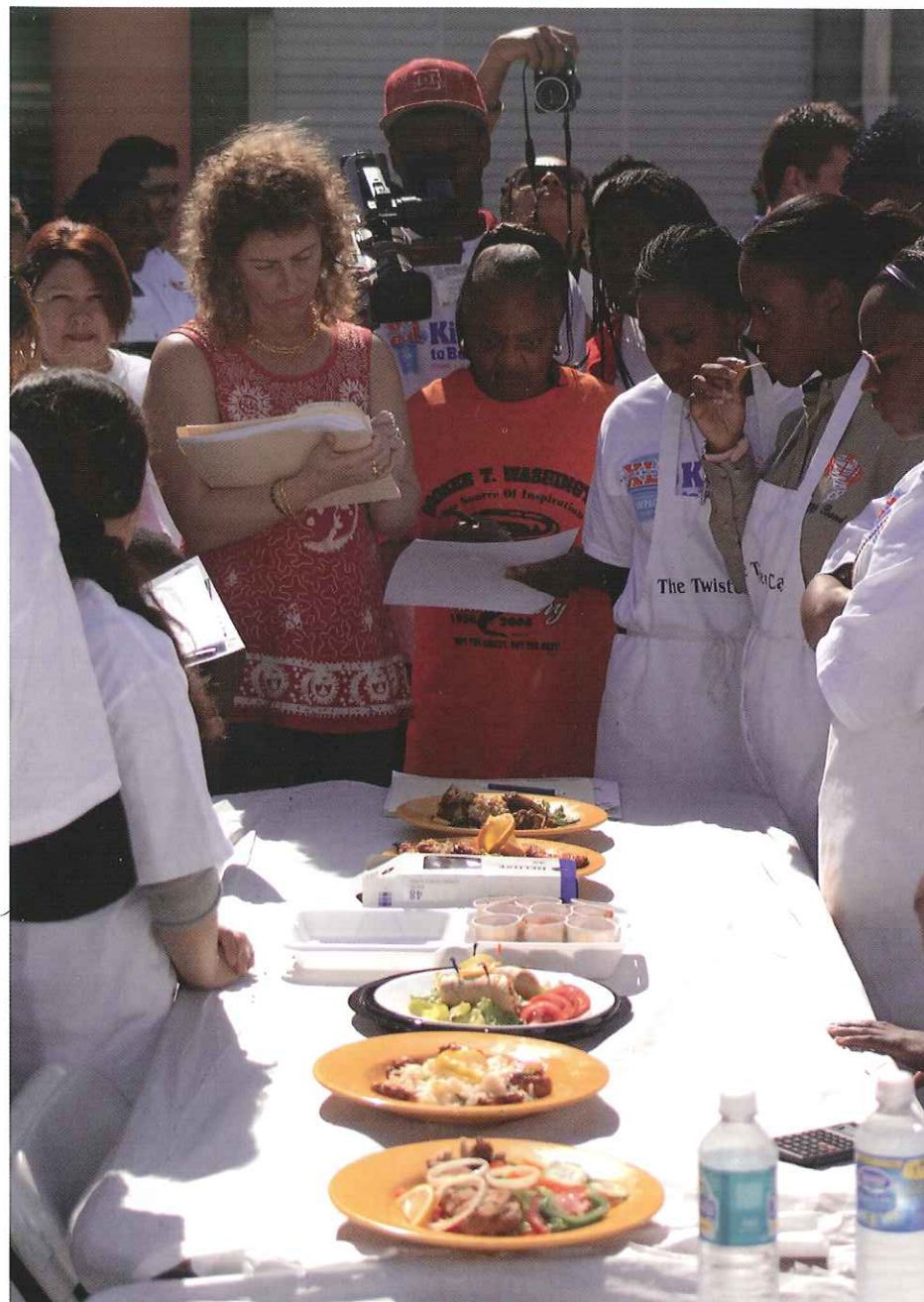
Overtown Cook-Off judging table